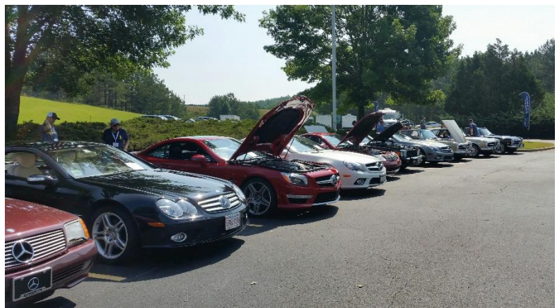
Some of the cars in the car Show.