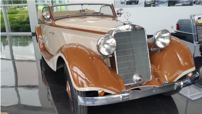
1936 "290" Cabriolet A.