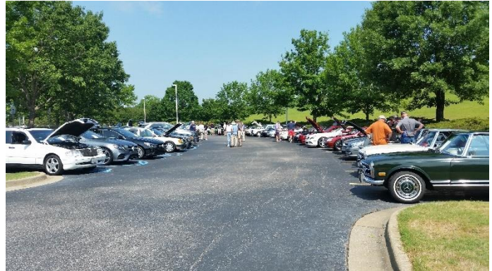
Concours line up I believe there were 100 cars