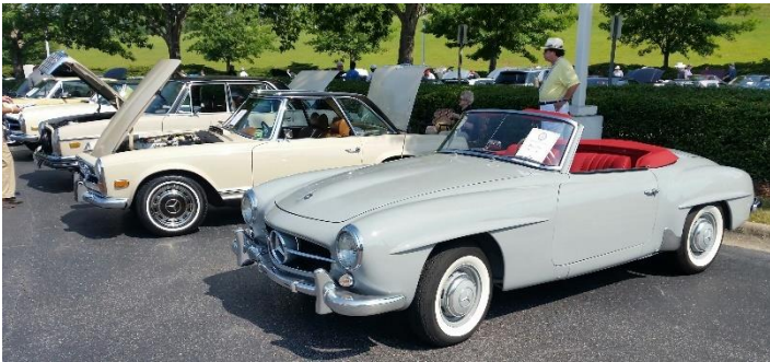
The SL Row