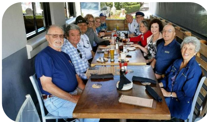
Looks like the folks are ready for a stein and some lunch